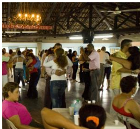
Salsa dancing in Cali

The citizens of Cali like their salsa hot and spicy. Not the tortilla chip or nacho kind, but the music-blasting, hip-gyrating, sweat-inducing sort. After a mere 24 hours in the self-proclaimed "Capital of Salsa," it's easy to see that this southwest Colombian city lives up to its name.